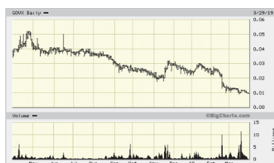
GOVX (OTC.BB) One-Year Chart

GeoVax Labs, Inc. 1900 Lake Park Drive, Suite 380 Smyrna, GA 30080 Phone (678) 384-7220 Fax (678) 384-7281 www.geovax.com