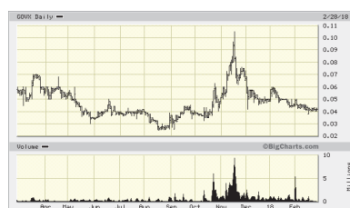
GOVX (OTC.BB) One-Year Chart

GeoVax Labs, Inc. 1900 Lake Park Drive, Suite 380 Smyrna, GA 30080 Phone (678) 384-7220 Fax (678) 384-7281 www.geovax.com